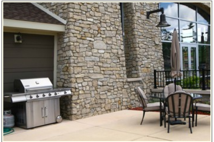
Pool Side Eating Area