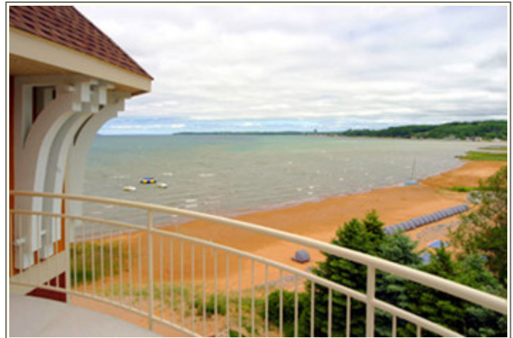
Angled Views from 5th Floor Balcony

Jason Hulet | 231-922-2200 | Reservations@VisitNorthernShores.com