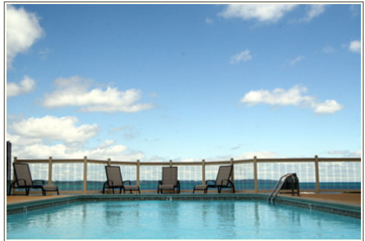
Bayside Heated Swimming Pool